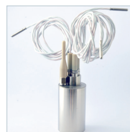
NanoVACQ 3Td FullRadio with Teflon probes