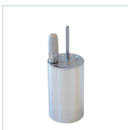
NanoVACQ 1Tc FullRadio, short antenna