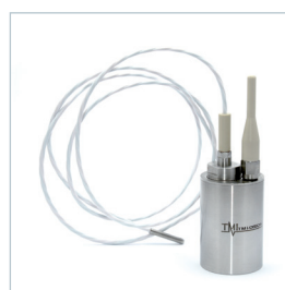
NanoVACQ 1Td FullRadio with Teflon probe