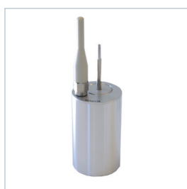
NanoVACQ 1Tc FullRadio, standard antenna