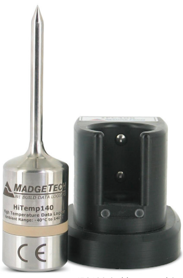
IFC400 (sold separately)

The HiTemp140 can store up to 32,700 readings, and features a rigid external probe capable of measuring extended temperatures, up to 260 °C (500 °F). Custom probe lengths are available up to 7 inches. The device records date and time stamped readings, and has non-volatile solid state memory which retains data even if the battery becomes discharged.