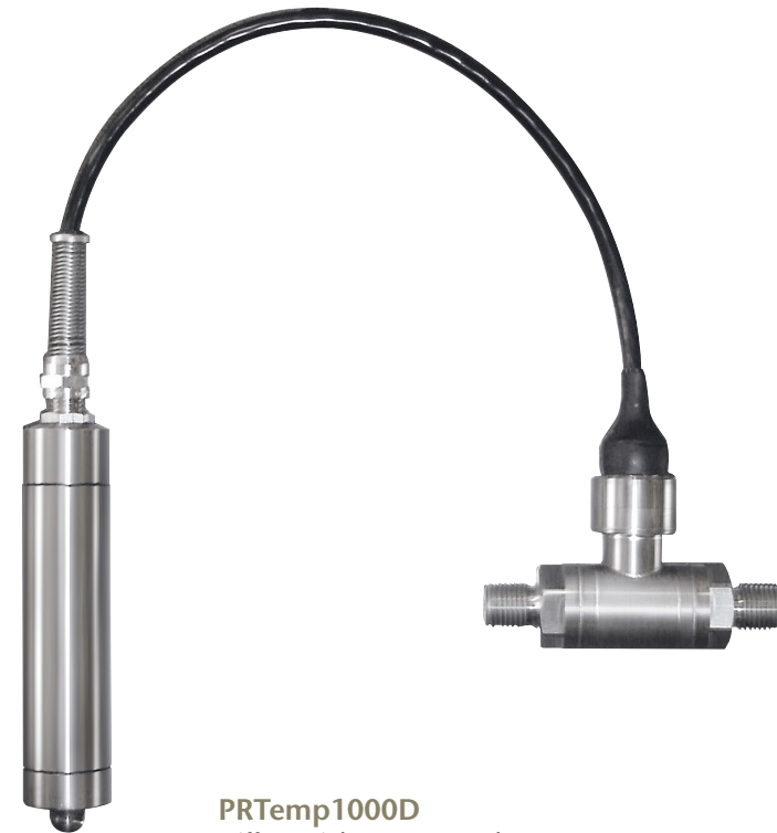
PRTemp1000D Differential Pressure and Temperature Data Logger