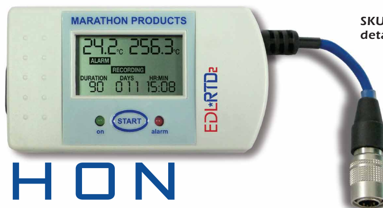
SKU #7012 with detachable probe.