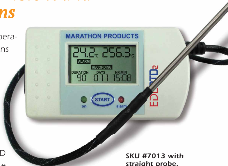
SKU #7013 with straight probe.

In conjunction with our MaxiThermal software, you can document your high-temperature uses for your GxP and FDA regulated environment. To download recorded information, simply plug the unit into a PC using a standard USB connector. The USB cable and PC software are available as accessory items.