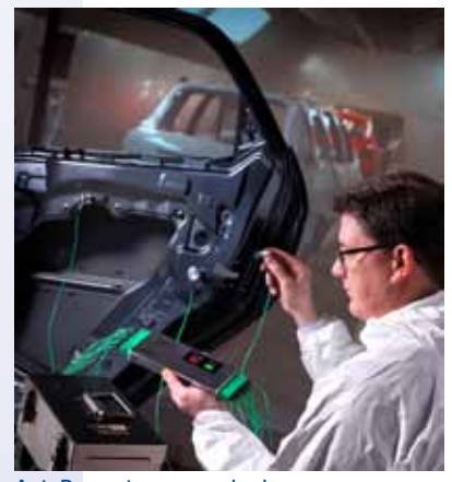
AutoPaq setup on car body