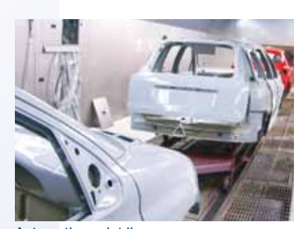
Automotive paint line

The DATAPAQ AutoPaq is a customized thermal profiling system for temperature monitoring of paint, adhesive and sealant cure processes used in the automotive assembly market. Offering up to 20 channels of measurement in a single system, the DATAPAQ AutoPaq is the perfect tool for performing detailed cure validation of new installations or optimizing existing lines for new models. With real time RF capability, the system may also be the preferred choice for routine live monitoring of paint operations as part of standard QA procedures.