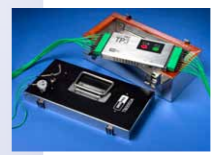
AutoPaq 20 channel system (TP3026 and TB0050)