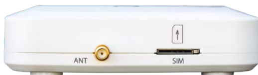
DIGI CONNECT IT MINI LEFT