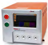
Isaac HD Multi-Function Leak Tester