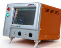
Zaxis 7i Large Display Leak Tester