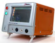
Zaxis 7i Large Display Leak Tester