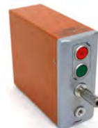
iKit Single Channel Leak Tester