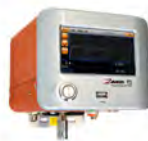
Zaxis PD Pressure Decay Leak Tester