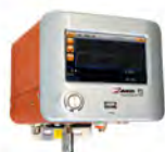
Zaxis PD Pressure Decay Leak Tester