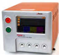
Isaac HD Multi-Function Leak Tester