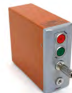
iKit Single Channel Leak Tester