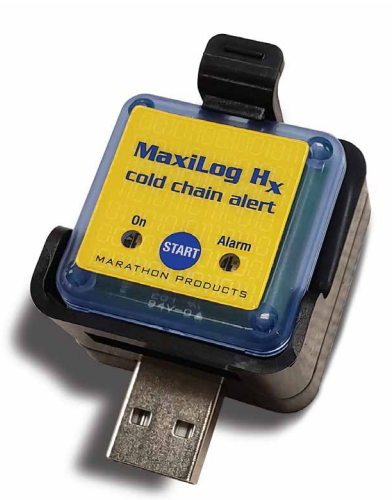
USB Reader Station SKU#9052