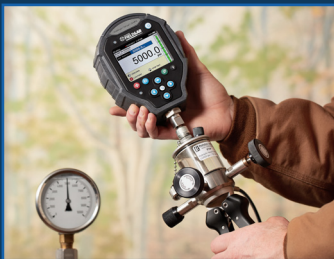
Gauges & Calibration References

Ralston Instruments provides complete pressure calibration solutions for a wide range of applications, saving time and taking the guesswork out of critical pressure testing, maintenance and repair operations.