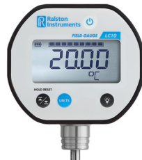
Field Gauge LC10-TA Digital Probe Thermometer