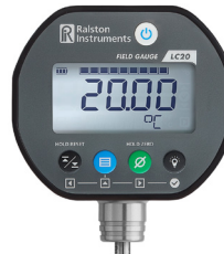
Field Gauge LC20-TA Digital Probe Thermometer