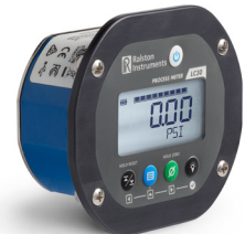
Panel Mounted Field Gauge LC30

Ralston Instruments provides complete pressure calibration solutions for a wide range of applications, saving time and taking the guesswork out of critical pressure testing, maintenance and repair operations.