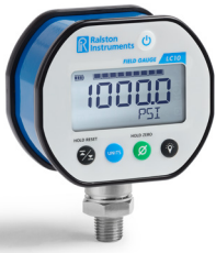
Field Gauge LC10