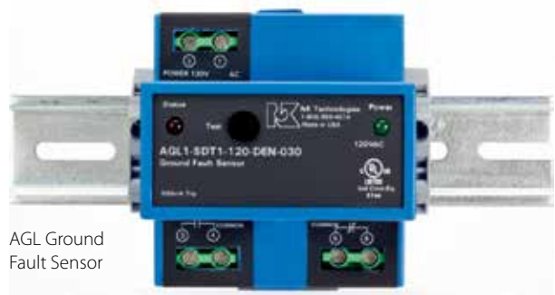
AGL Ground Fault Sensor