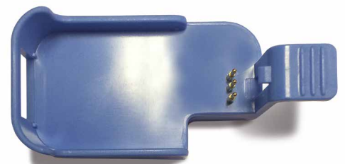
Maxilog MaxiThermal2 Reader Station

Please call 1-510-562-6450 for more information or to place an order.