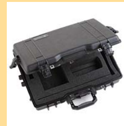
Probe and Readout Case