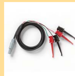
Universal RTD Adapter