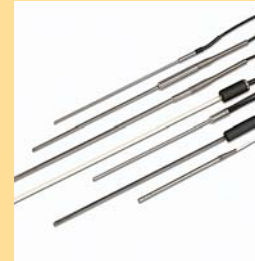
Calibrated Temperature Sensors

A wide array of accessories is available to help you maximize productivity, but the following are essential for most users.