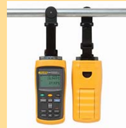
TPAK Magnetic Hanger