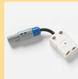
Universal Thermocouple Adapter