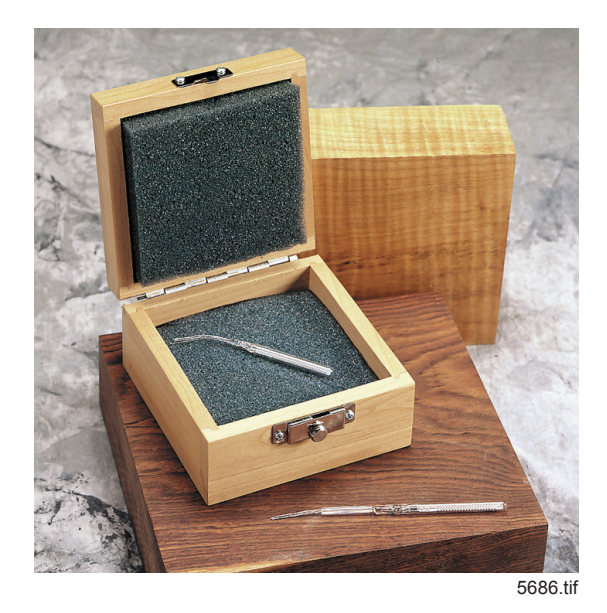
Figure 1. 5686 Glass Capsule Standard Platinum Resistance Thermometer

The 5686 is carefully annealed at the appropriate temperatures and precisely tested for stability. The sensing elements are fabricated using high-purity platinum wire wound in a strain-free design on a fused silica cross frame. The special glass capsule of the 5686 is pressure sealed with 5N pure helium.