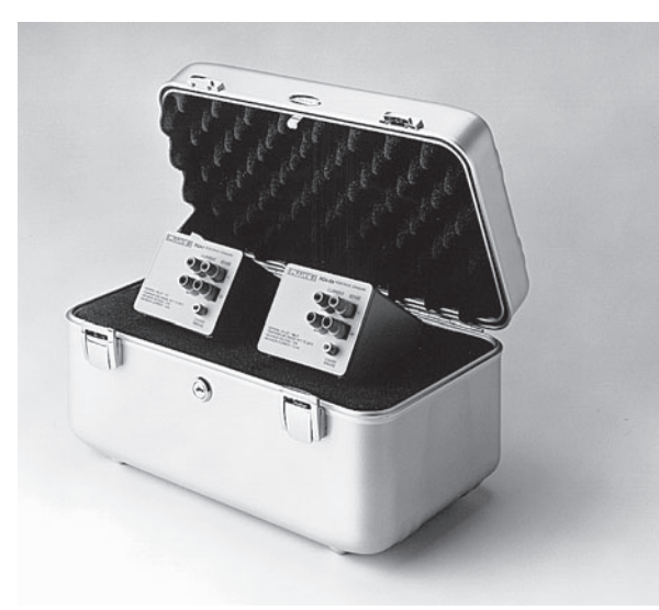
Optional 742A-7002 transit case

742A-1 1\Omega Resistance Standard 742A-1.9 1.9\Omega Resistance Standard 742A-10 10\Omega Resistance Standard 742A-25 25 \Omega Resistance Standard 742A-100 100\Omega Resistance Standard 742A-1k 1 k \Omega Resistance Standard 742A-10k 10 k \Omega Resistance Standard 742A-19k 19 k \Omega Resistance Standard 742A-100k 100 k \Omega Resistance Standard 742A-1M 1 M \Omega Resistance Standard 742A-10M 10 M \Omega Resistance Standard 742A-19M 19 M \Omega Resistance Standard 742A-7002 Transit Case, holds two units