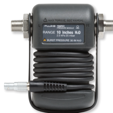
The 7250LP is specifically designed to calibrate low pressure gauges, transducers and portable calibrators such as the Fluke 700 series, as well as Magnahelics and virtually any low pressure sensor, gauge or test equipment.

Computer interface: The 7250LP is provided with both an RS-232 and IEEE-488 interface, and syntax for all Series 7250s follows SCPI protocol for easy programming. COMPASS for Pressure, an off-the-shelf software package, is available. As a standard feature, software written for Ruska's previous generation Series 7215, 7010 and 6000 instruments is fully supported by the 7250LP. The 7250LP can be set to 510 emulation mode to use software originally written for the GE Druck DPI 510. Firmware updates can be performed over the RS-232 interface. A MET/CAL® software driver is available. In addition, a LabVIEW driver is available as a free download.