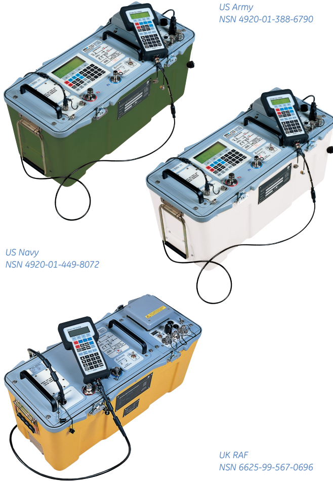
US Army NSN 4920-01-388-6790

Military authorities throughout the world have adopted the ADTS 405F variant as standard equipment such as: